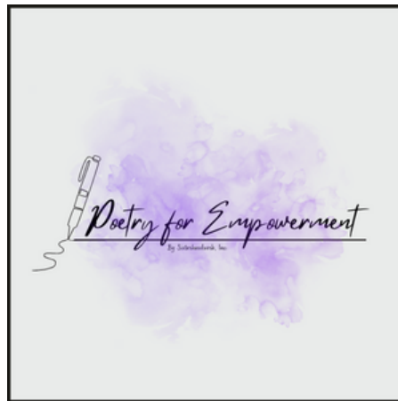
Poetry for Empowerment